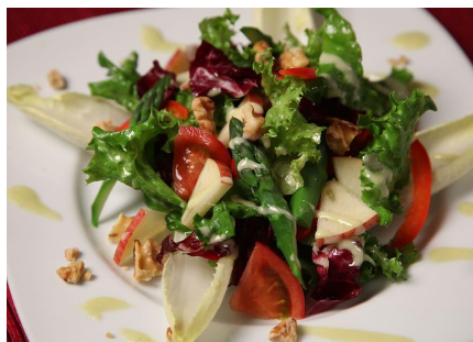
Insalata Palate cleanser