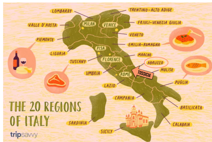
Illustration by Grace Kim for TripSavvy

From the Canadian Museum of Immigration at Pier 21