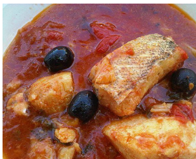
Secondo Piatti Baccalà (Salted Cod)