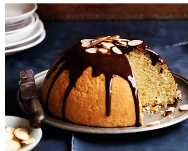
Dolci Parozzo (Almond Cake)