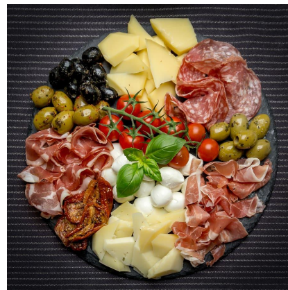
Antipasti Olives, meats, & cheeses