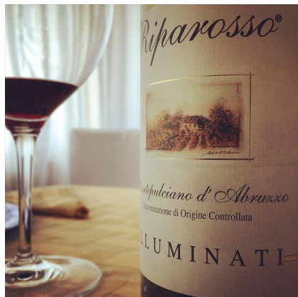
Aperitif Montepulciano d'Abruzzo (Red wine)