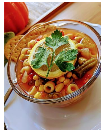
Primi Piatti Pasta Fagioli (Soup)